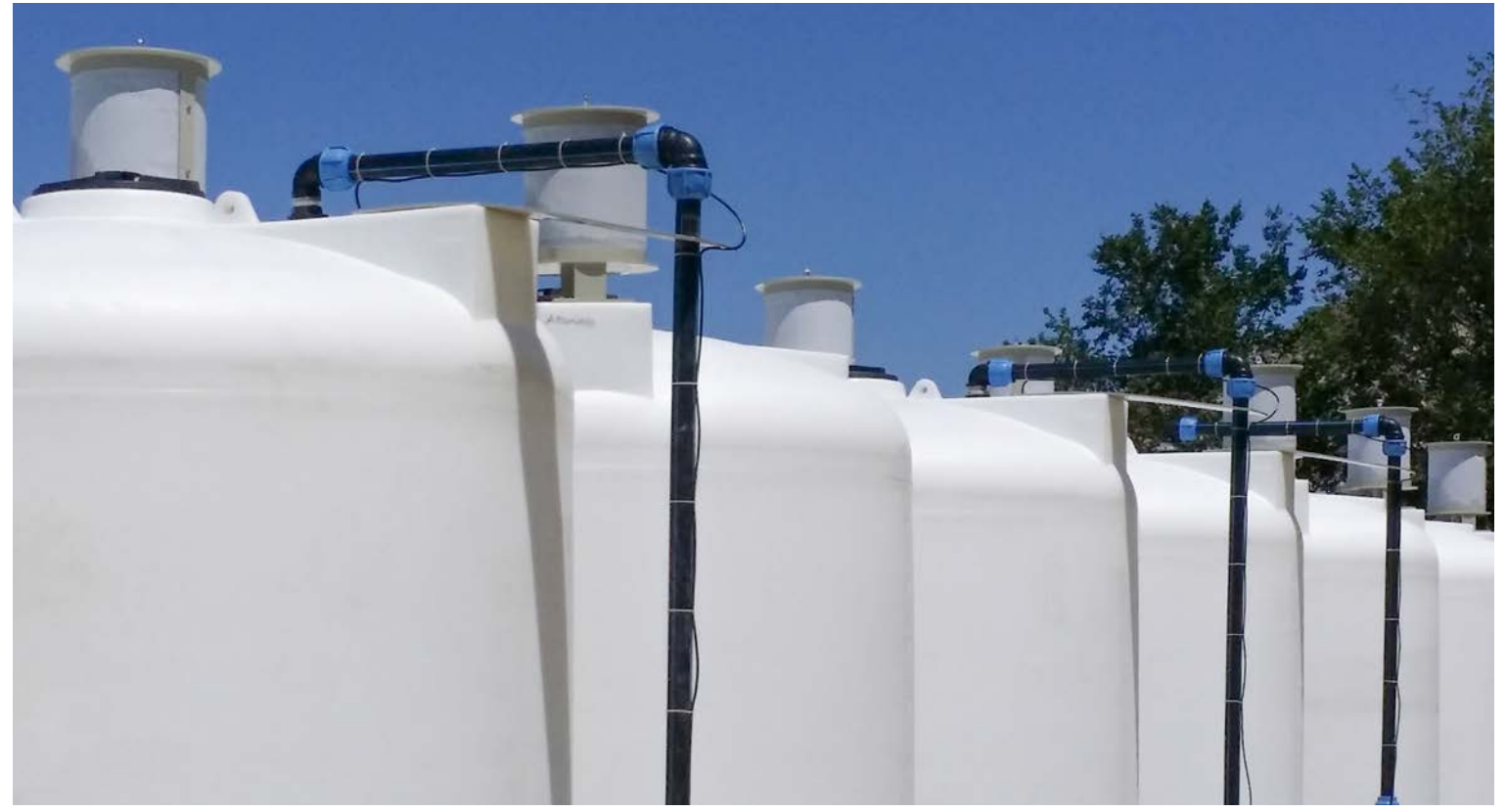
BMB Technologies & Services S.r.L.

Via Cappelletta 90, 27040 BORGO PRIOLO (PV) Tel: +39 0383 872776 email: info@bmbtech.it Copyright ©2022 B.M.B. Technologies & Services srl | All rights reserved